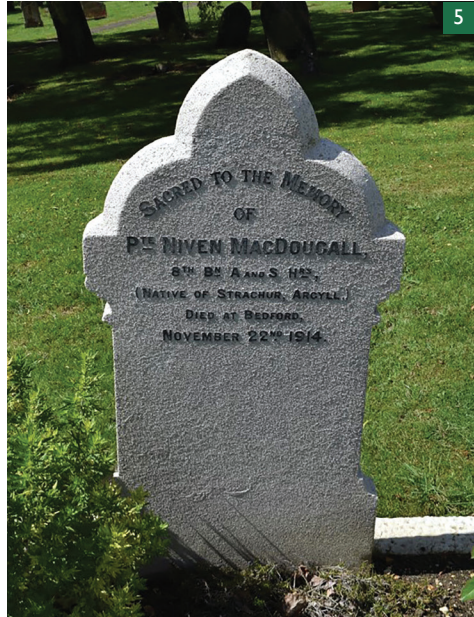
5 PRIVATE MEMORIAL AT FOSTER HILL ROAD CEMETERY (BEDFORD CEMETERY), BEDFORDSHIRE