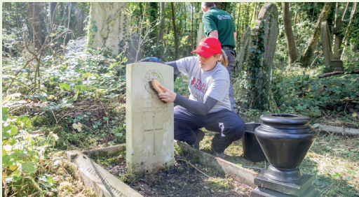
EYES ON HANDS ON VOLUNTEERS CLEANING CWGC HEADSTONES IN ARNOS VALE CEMETERY, BRISTOL