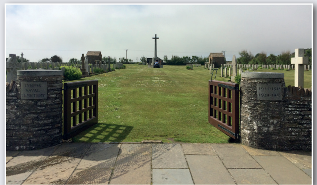
Lyness Royal Naval Cemetery