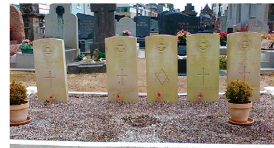
Gouesnou churchyard 5 graves From: Great Britain, Shanghai