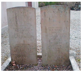
Guiles churchyard 6 casualties From: Great Britain, New Zealand

Use the modern flags to discover where some of those who are buried and remembered here came from.